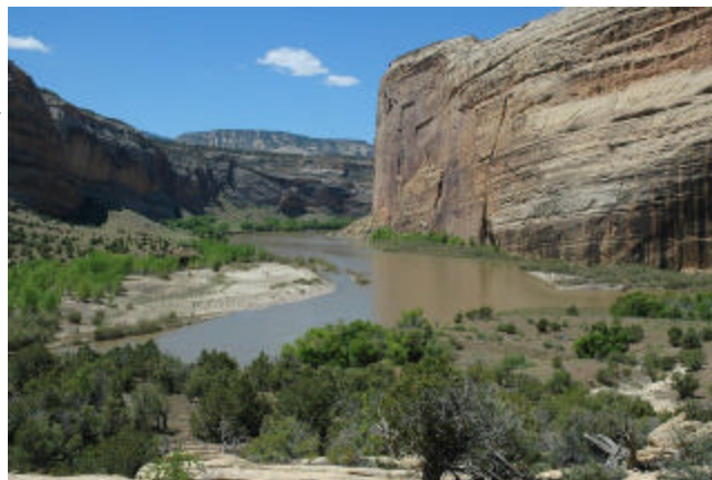
Geoffrey Hammerson – Yampa-Green Confluence

only 13 other species co-evolved. Four of these species are endangered and are struggling to survive changes introduced by human development. Life histories of these very unique fish are only recently being understood so recovery efforts can be implemented.