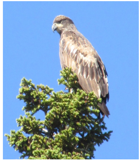
Immature Bald Eagle by Carole Hossan.

the weather is inclement: visit the Fishing Bridge Museum and Visitor Center! Inside this 1931 national park rustic architectural gem, you will find specimens, mounted by Carl Russell, of a variety of birds that may be found in Yellowstone, and that hold perfectly still for your photographs.