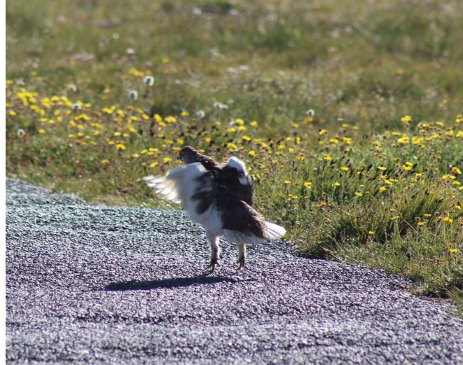
White-tailed Ptarmigan in

Sept. 5, Monday (Labor Day), McMurry Natural Area. Leader: John Shenot, johnshenot@gmail.com or 802-595-1669. McMurry Natural Area is better known to anglers than birders, as it has more fish diversity than any other city natural area. But it has a nice mix of bird habitat in a small area and easy level trails. It's a good place for beginners to learn about common birds, but some exciting rarities have also been found here in the past. Meet at 7 a.m. in the river access parking lot on the west side of N. Shields Street just north of the Poudre River bridge.