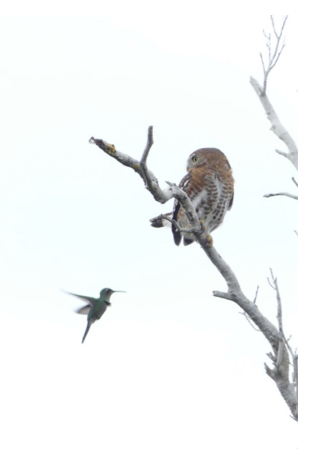
Cuban Pygmy Owl and Cuban Emerald Hummingbird by David Dunwiddie.

We began to realize that Cuba is rich in biodiversity. The number of endemic plant and animal species is said to be as high as 40%; there are over 350 recorded bird species. In Guanahahcabibes, we saw the Bee Hummingbird, but the showiest birds were a flock of Spindalis, a colorful strippedheaded tanager. Bright migrant warblers were evervwhere, but also