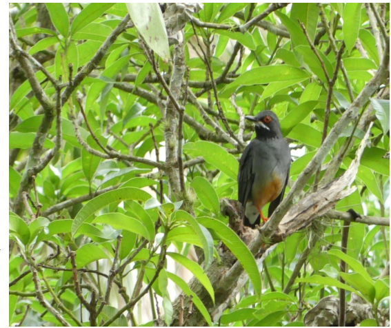
Red-legged Thrush

our group began to count birds, including the Cuban crows. Before leaving Havana. we visited the home of Cuba's famous naturalist