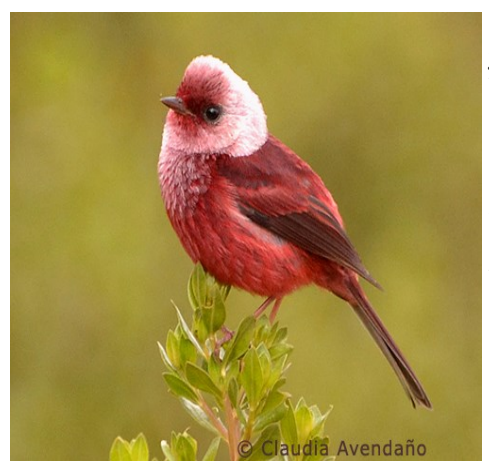
Pink-headed Warbler.

This November, ioin fellow Auduboners in experiencing the mystique of Guatemala's highland volcanoes and rainforests at the breathtaking Mayan ruins of Tikal National Park. Quetzal Tours is offering an eightday, relaxed-pace birding and nature photography adventure, led by