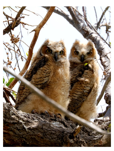
Great-horned Owl chicks

The members of the FCAS Board wish to thank all those who supported this year's Birdathon effort with their time and/or financial contributions.