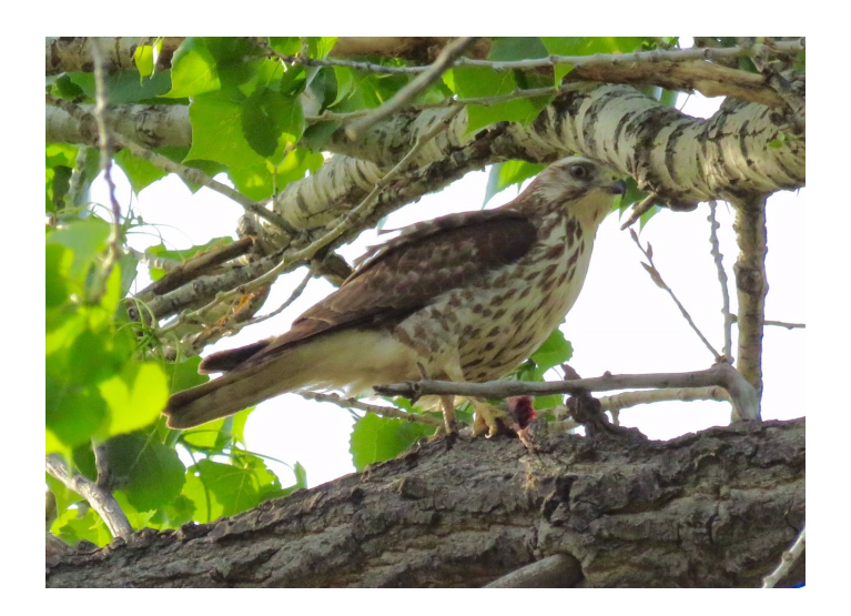
Broad-winged Hawk