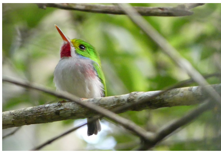
Cuban Toddy

As a long time birder who has lived in Fort Collins as well as overseas, I look for opportunities to widen my birding horizons. Cuba is a country that has always intrigued me and it has 30 endemic species of birds. In December, 2015, The Caribbean Conservation Trust