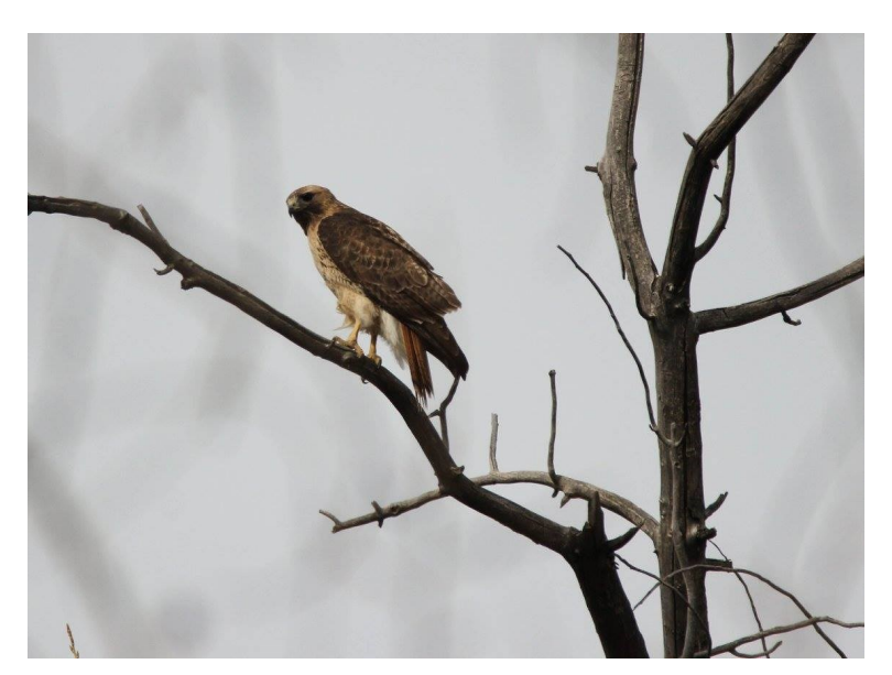
Red-tailed Hawk at Bear Creek Lake Park, City of Lakewood, CO.

https://www.facebook.com/FortCollinsAudubonSociety