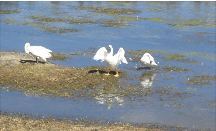
Trumpeter Swans in the Yellowstone River

I saw Ospreys every year at a nest on top of a jutting