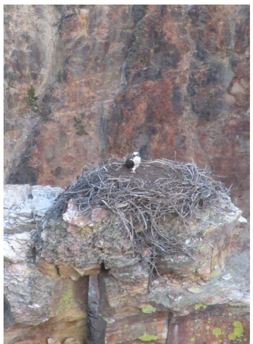
Osprey nesting in the Grand Canyon of Yellowstone.

In lieu of visiting Yellowstone National Park in early September for the fourth consecutive year, I will find solace by reminiscing via this article about my birding experiences during those visits. If you are planning a visit to Yellowstone National Park or would like to peruse what birds you may encounter, the following is a link to a checklist of birds you might see: <a href="https://">https://</a>